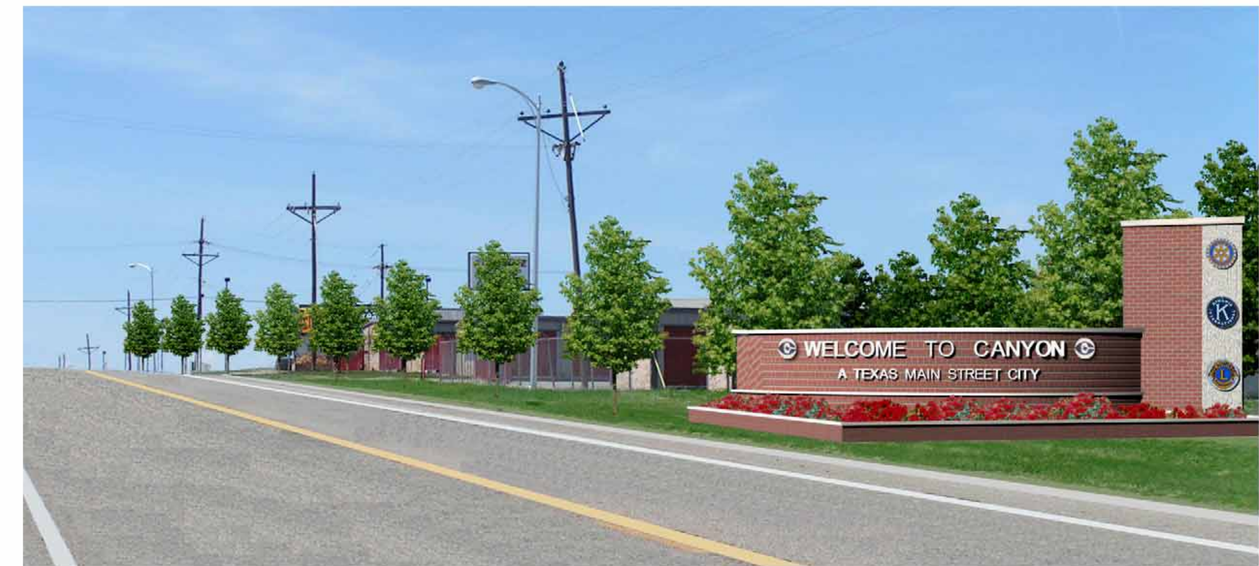
Planning for Canyon's future begins with the development of new attractive and inviting gateways.